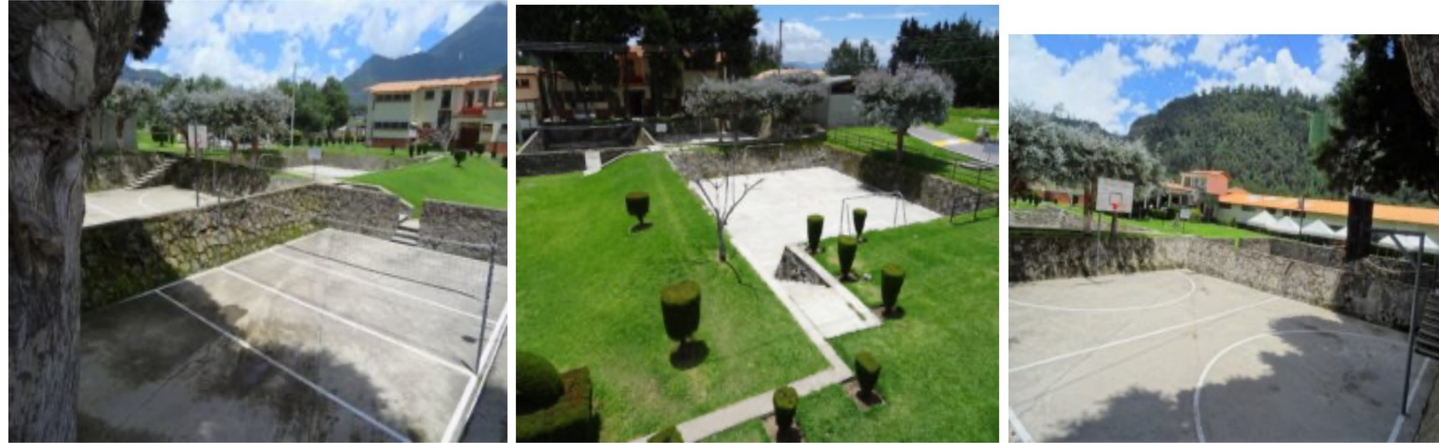
Hostal del Valle