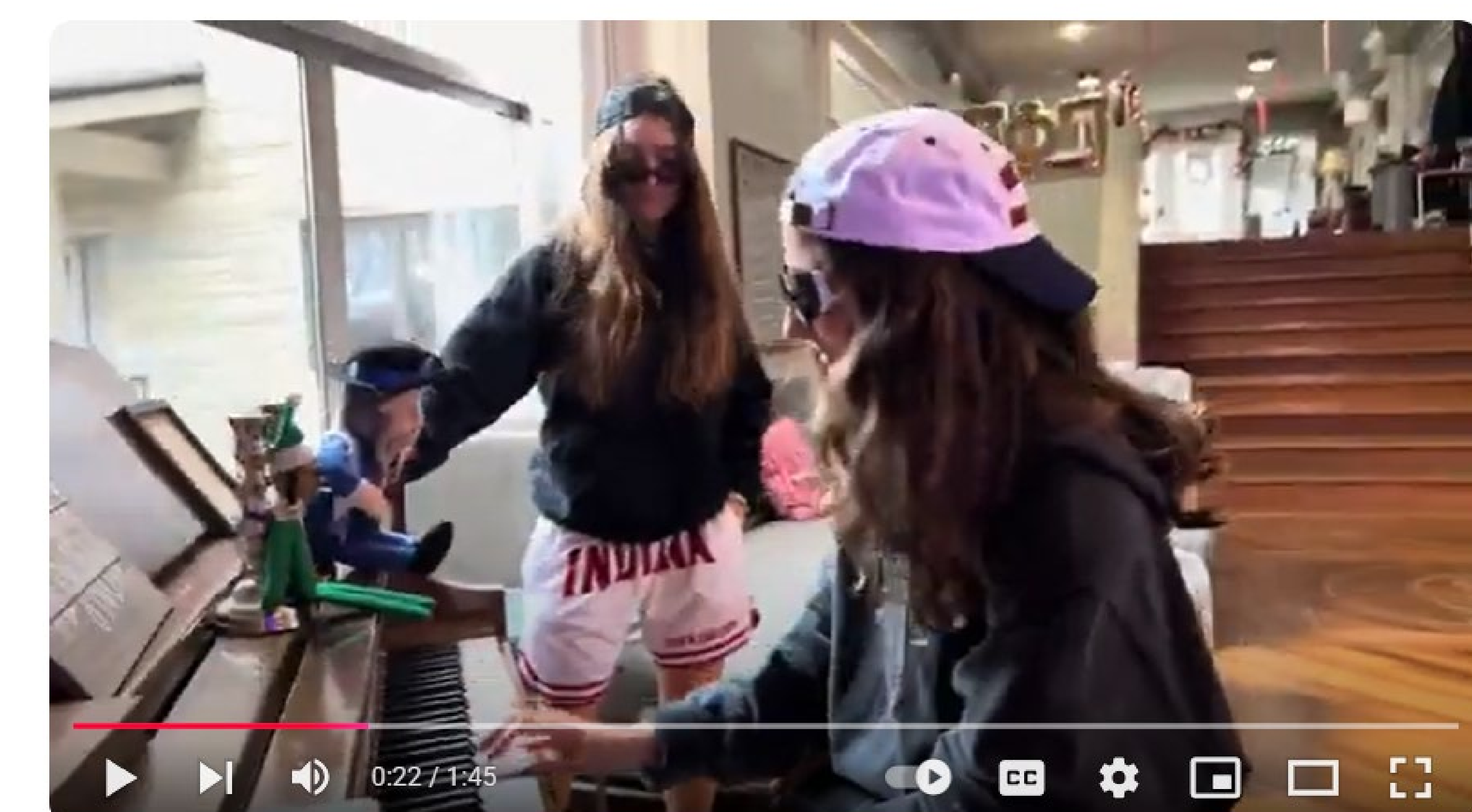
Women in Business Law by SheGrooves