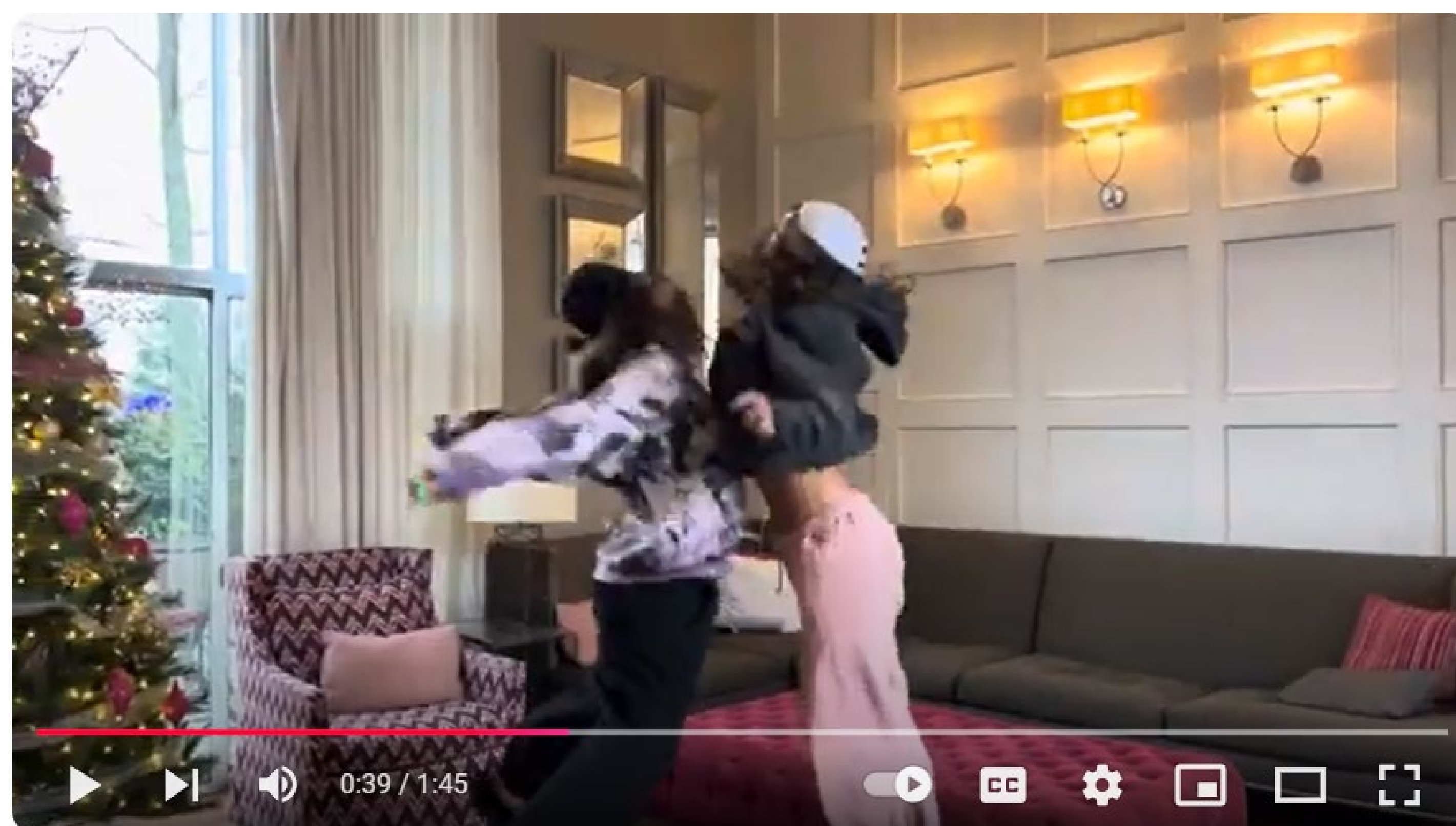
Women in Business Law by SheGrooves